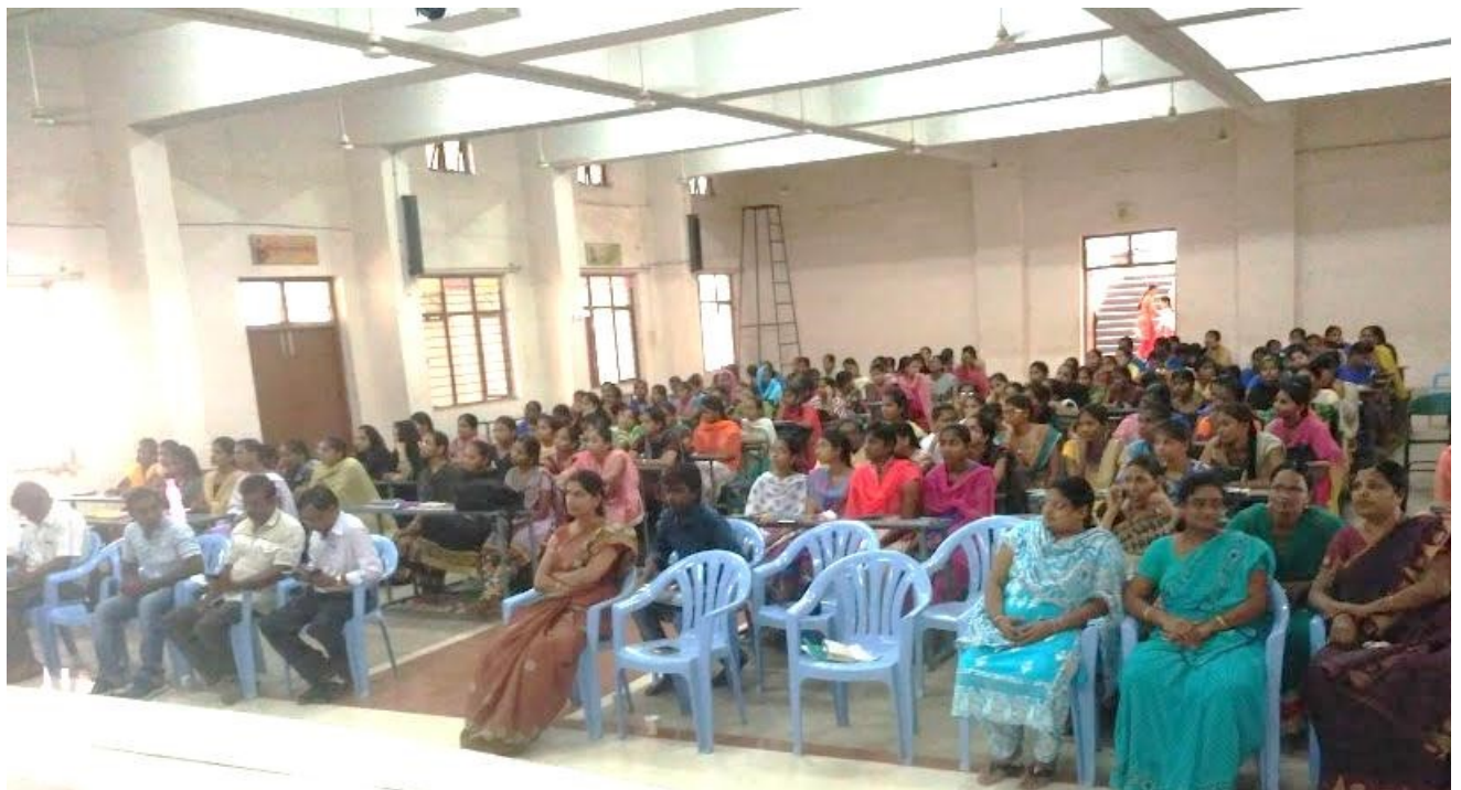
Nearly 200 Staff and Students are participation in the programme