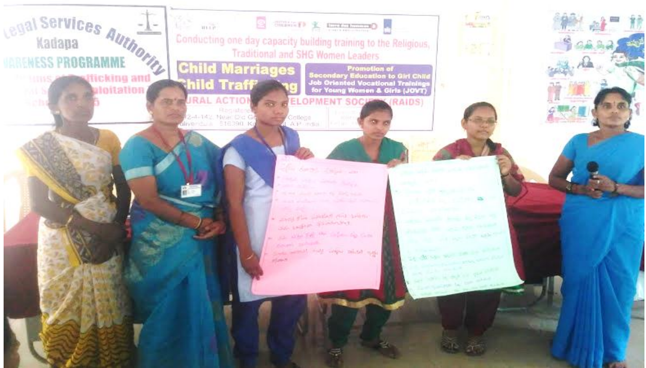
24-08-2017: KISHORI VIKASAM PROGRAMME