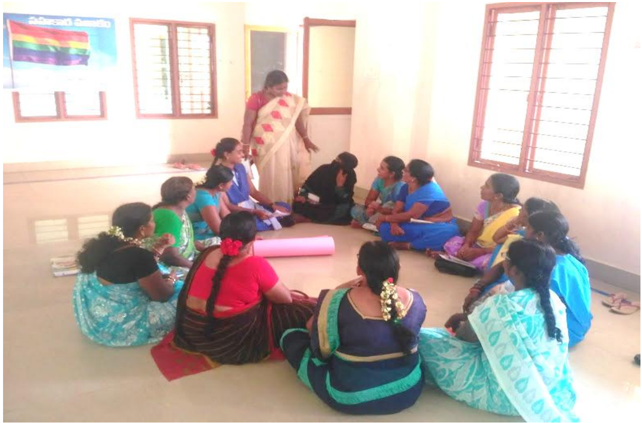
Group discussion on child marriages and human trafficking